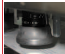
Plate quality management

We are offering special designed bending systems for sheet-fed printing which perform the claimed bending of the printing machine manufacturer. The treatment of multiple plate formats with same bending angle is possible. On request an additional bending configuration can be integrated. If required, the register punching can be integrated with video control positioning for maximum register precision.